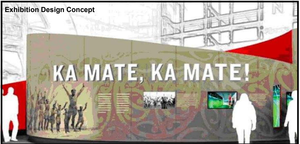
Exhibition Design Concept